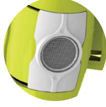
Spray or Foam