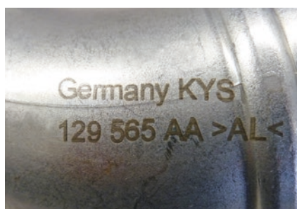
Marking of metal parts