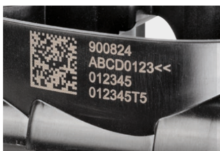
Marking of plastic parts