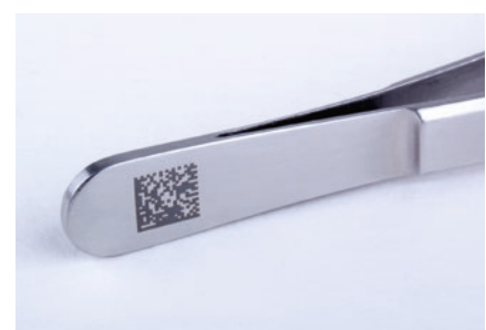
Marking of medical instruments