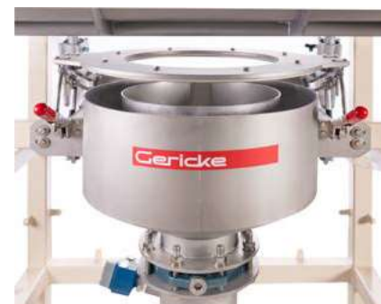
Docking station opened