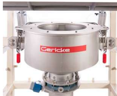
Docking station closed