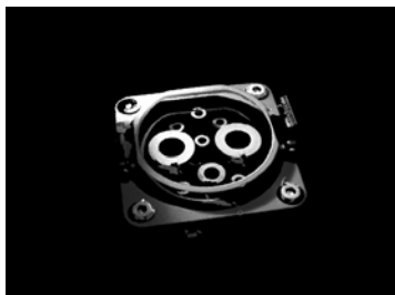
Car charging port