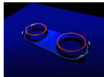
0.68 mm thick workpiece