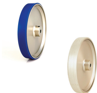
Measuring wheel FDA 500