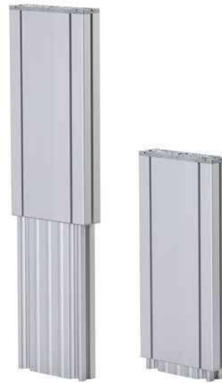
without mounting brackets