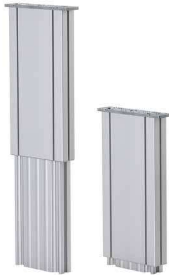
with mounting brackets