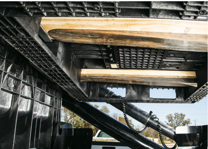
Improved Hardwood Bottom Deck Boards