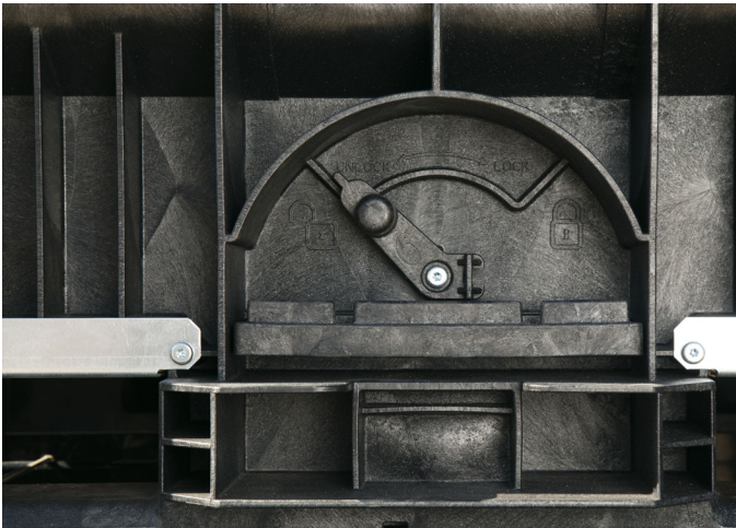
Securable Slide Gate Latch