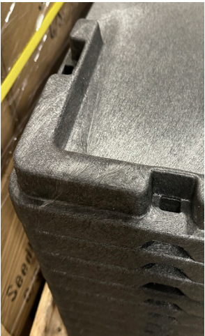
Securable Lid Design