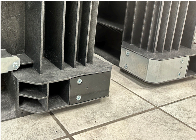
4-Hole Metal Corner Hit Plates