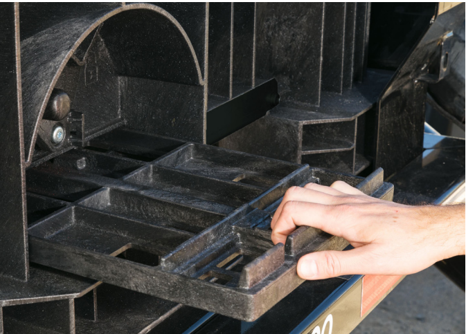
Slide Gate for Discharge of Contents