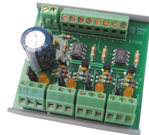
ET420: 4-20 mA Current-/Voltage Converter for 4 channels (Art.-Nr. ANA6525E / optional)

The suitable software driver for the PLC-ANALYZER pro 6 enables you to record and analyze the measured values in the usual comfortable way. Also electric current can be measured by using the AD_USB-Box. Therefore you can use the optional ET420 (4-20 mA current/voltage converter)