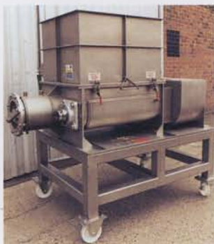
XF150/R roller feeder

APPLICATION GUIDE: For transforming a paste mass into shapes suitable for further processing