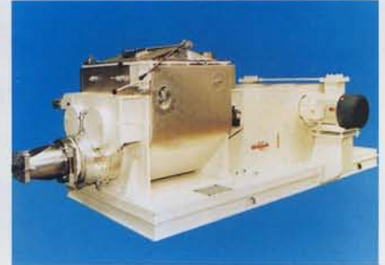
250 litre Z blade mixer extruder