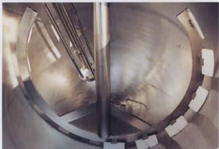
Inclined angled agitator with scrapers and high shear mixer