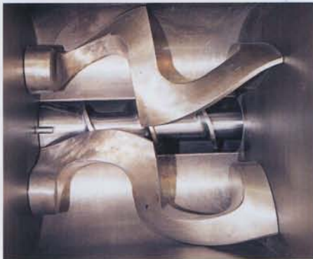
Z blade with extruder discharge