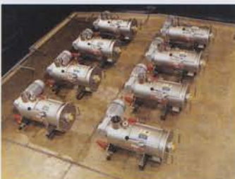
14 litre continuous mixers