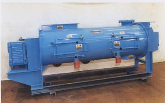
200 litre continuous RT mixer