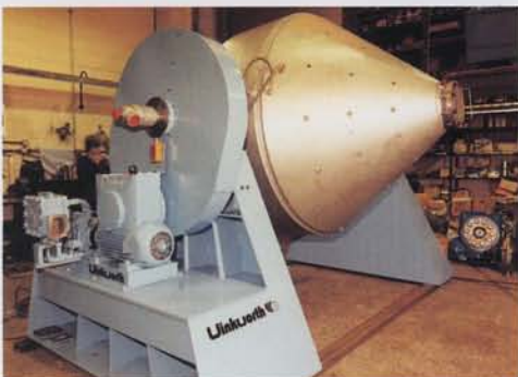
5000 litre double cone blender/dryer