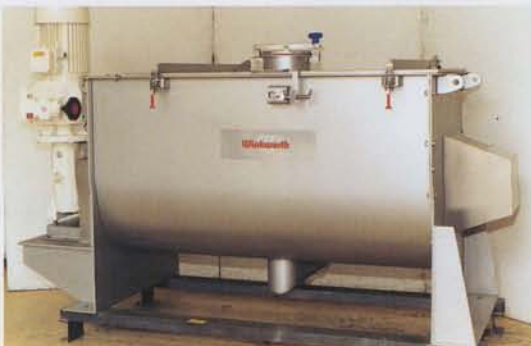
2000 litre all stainless steel U trough mixer