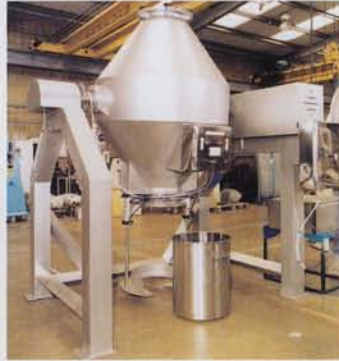
600 litre double cone blender with drum loading system