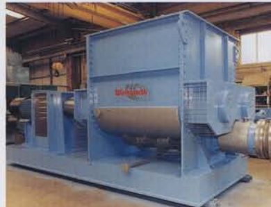
2130 litre Z blade mixer extruder

Available with stainless steel contact parts, jackets for heating or cooling, cored blades for increased heat transfer, vacuum lids and many other features