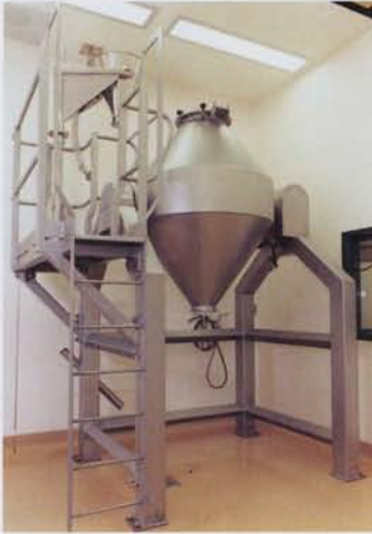
500 litre double cone blender with access platform for vacuum loading

APPLICATION GUIDE: For gentle mixing of powders, granules and fragile materials