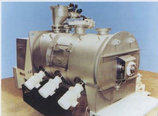
2000 litre jacketed RT mixer with refiners

For pastes, doughs, powders, powders with liquid additives and slurries