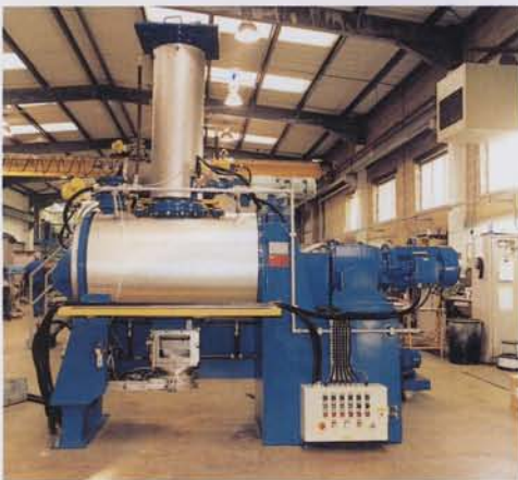
400 litre RT mixer/dryer

APPLICATION GUIDE: For drying damp powders, pastes and slurries. For sterilising powders and fragile food products