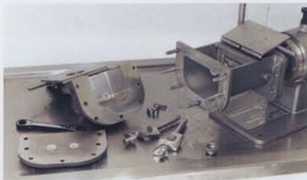
NEW laboratory 'Fast Clean' mixer