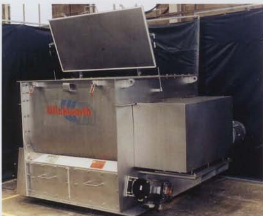
500 litre machine to current food specification

APPLICATION GUIDE: For fast, gentle mixing of powders and granules; coating of particulates