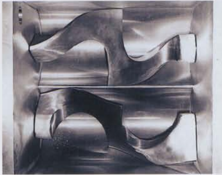
Standard Z blade

APPLICATION GUIDE: For viscous pastes and doughs