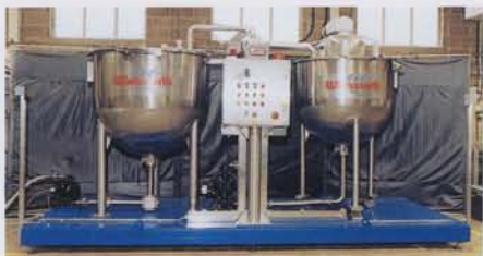
Skid mounted processing vessels

APPLICATION GUIDE: For mixing and processing of creams, liquids, sauces and slurries