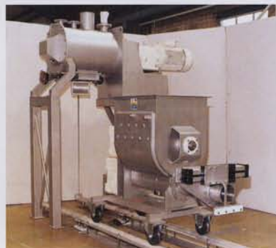
Far left: 2130 litre Z blade mixer extruder