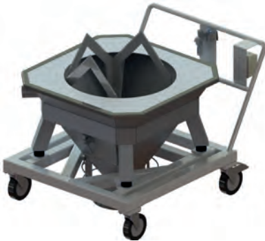
Mobile system with cutting device for filling floor silos