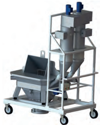
Mobile system with removable bag dumping lid and integrated dust filter for filling floor silos