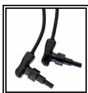
90° Universal connectors 4.0-4.7mm