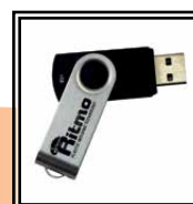
Software Ritmo Transfer