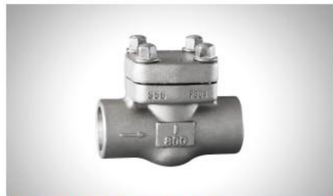
Forged Steel Check Valve Size:1/2"-2" Material:F304/F316 Pressure:800LB Connection:Threaded/Welded