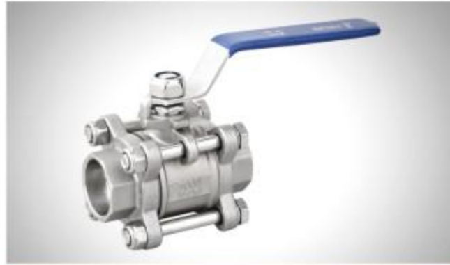
3PC Socket Welded Ball Valve Size:1/4"-4" Material:SS304/SS316/WCB Pressure:1000WOG Connection:Socket Weld