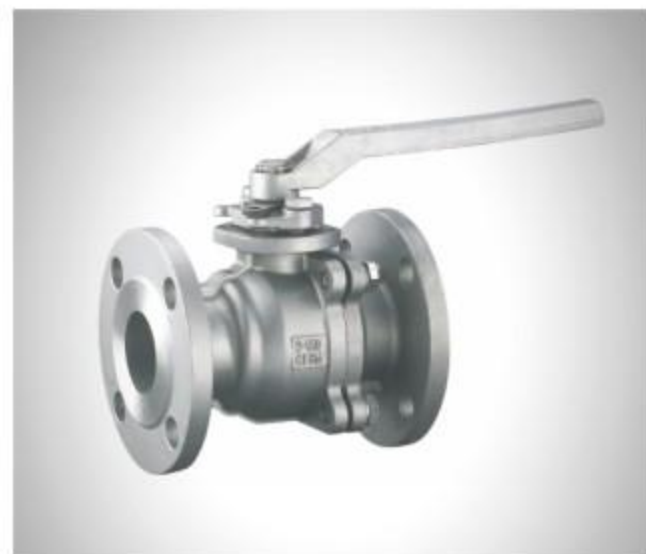
2PC Flanged Ball Valve Size:1/2"-12" Material:CF8/CF8M/WCB Pressure:150LB/300LB ANSI Flanged End