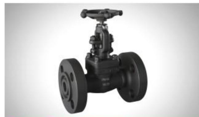
Flanged Forged Globe Valve Size:1/2"-2" Material:A105/F304/F316 Pressure:150LB/300LB/600LB/800LB Connection:Flanged