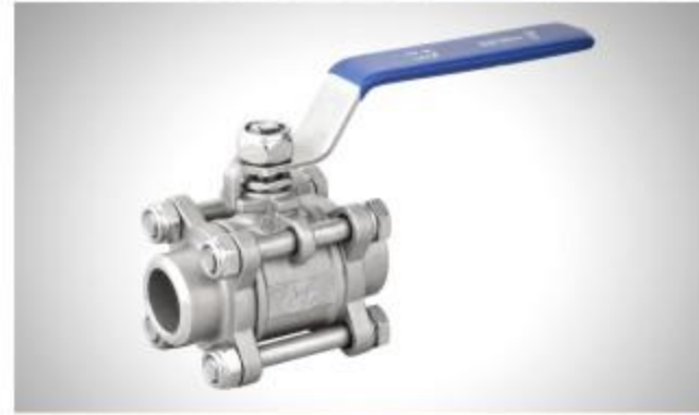
3PC Butt Welded Ball Valve Size:1/4"-4" Material:SS304/SS316/WCB Pressure:1000WOG Connection:Butt Weld