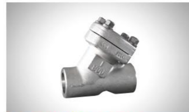
Forged Steel Y-Type Strainer Size:1/2"-2" Material:F304/F316 Pressure:800LB Connection:Threaded/Welded