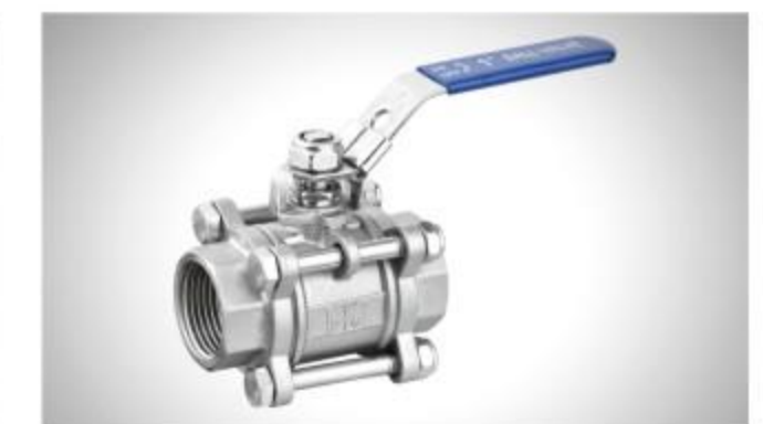
3PC Threaded Ball Valve Size:1/4"-4" Material:SS304/SS316/WCB Pressure:1000WOG Threaded Standard:BSPT/BSPP/NPT DIN259/DIN2999