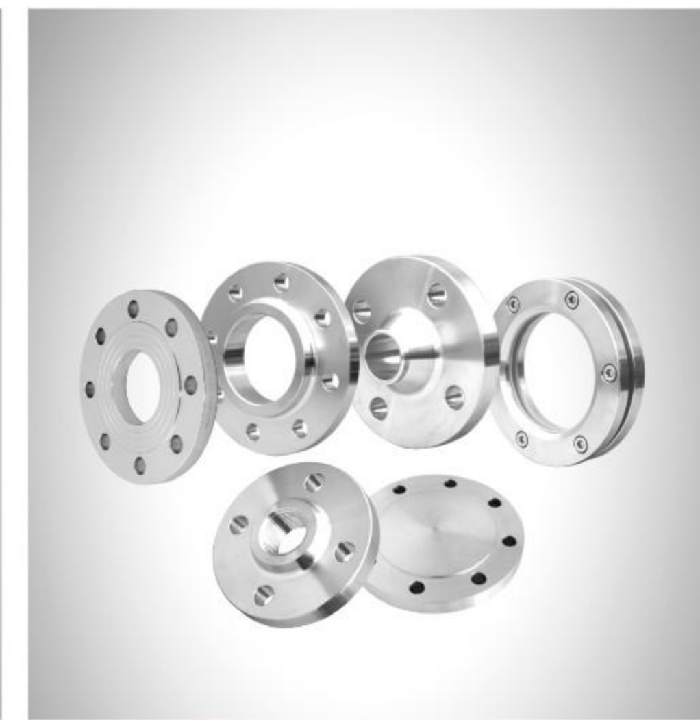
Flange Size:DN15-DN600 Material:SS304/SS316/SS304L/SS316L Pressure:150LB-300LB/PN16-40/10K-20K Standard:ANSI/DIN/JIS