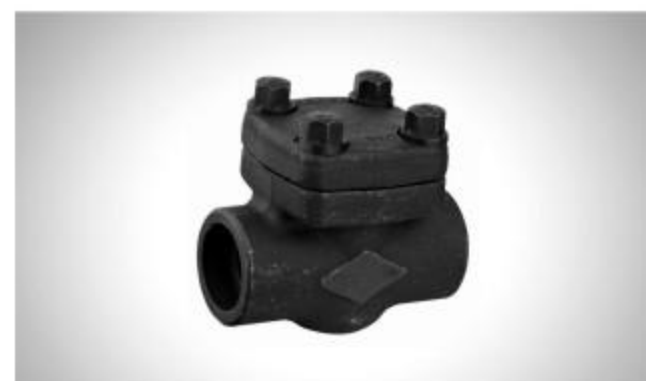
Forged Steel Check Valve Size:1/2"-2" Material:A105 Pressure:800LB Connection:Threaded/Welded