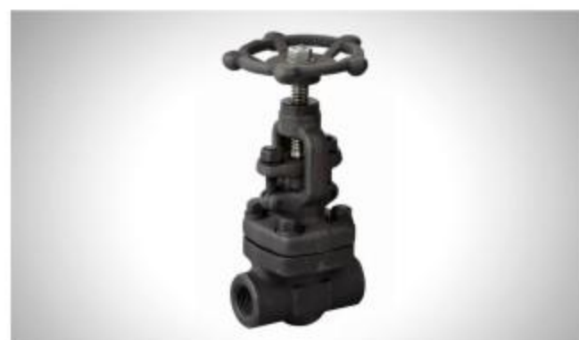
Forged Gate Valve Size:1/4"-2" Material:A105 Pressure:800LB Connection:Threaded/Welded