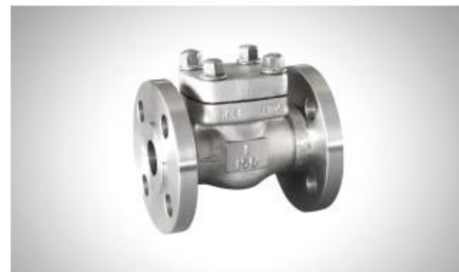
Forged Steel Flanged Check Valve Size:1/2"-2" Material:A105/F304/F316 Pressure:150LB/300LB Connection:FLanged