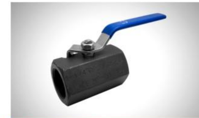
1PC Hexagonal Ball Valve Size:1/4"-4" Material:A105 Pressure:1000WOG-2000WOG Threaded Standard:BSPT/BSPP/NPT