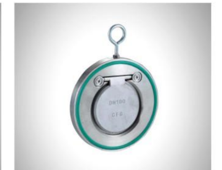
Single Plate Check Valve Size:1 1/2"-8" Material:SS304/SS316 Pressure:PN16