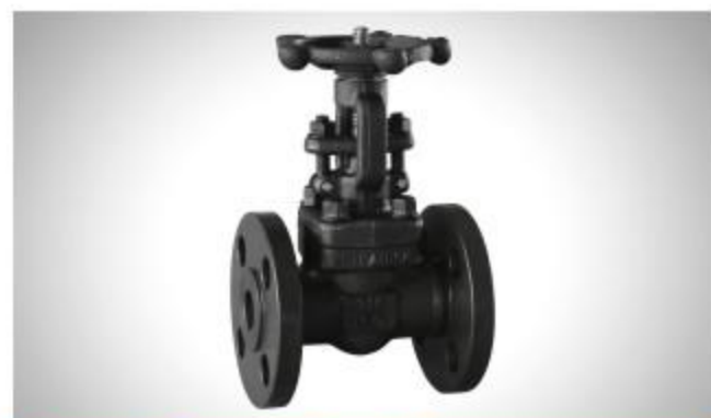
Flanged Forged Gate Valve Size:1/2"-2" Material:A105/F304/F316 Pressure:150LB/300LB/600LB Connection:Flanged