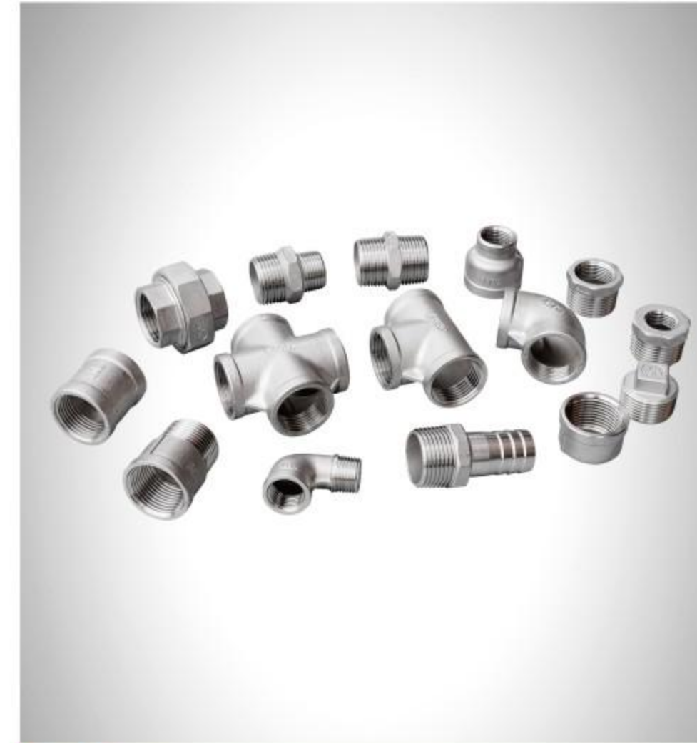
Pipe Fittings Size:1/4"-4" Material:SS304/SS316 Threaded Standard:BSPT/BSPP/NPT