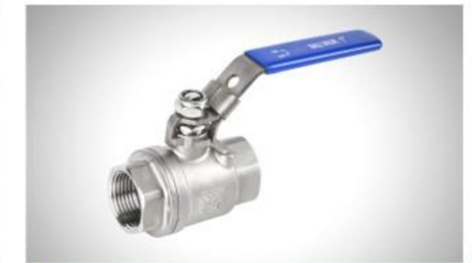
2PC Threaded Ball Valve Size:1/4"-4" Material:SS304/SS316/WCB Pressure:1000WOG Threaded Standard:BSPT/BSPP/NPT DIN259/DIN2999