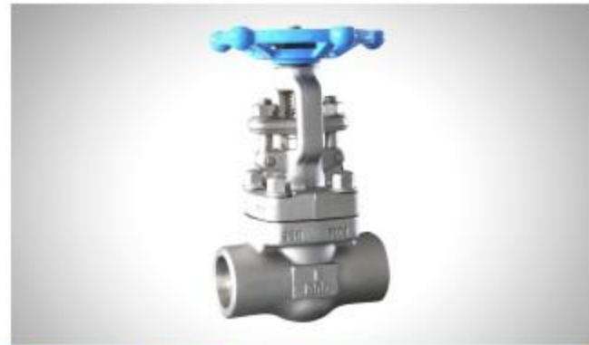
Forged Steel Gate Valve Size:1/2"-2" Material:F304/F316 Pressure:800LB Connection:Threaded/Welded