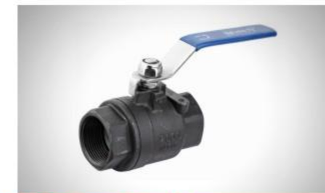
2PC Threaded Ball Valve Size:1/4"-4" Material:WCB Pressure:1000WOG Threaded Standard:BSPT/BSPP/NPT