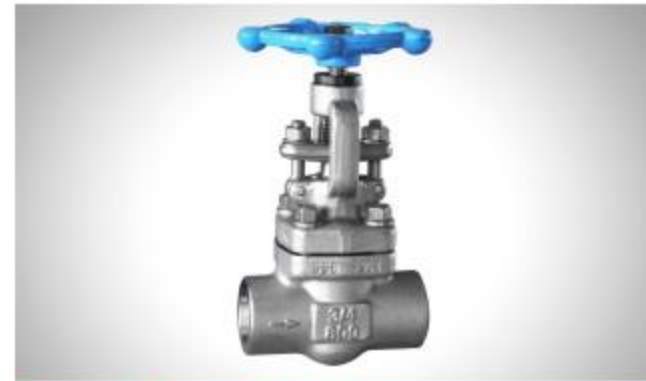
Forged Steel Globe Valve Size:1/2"-2" Material:F304/F316 Pressure:800LB Connection:Threaded/Welded