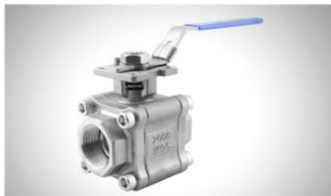
3PC Threaded Ball Valve With ISO5211 Mounting Pad Size:1/2"-2" Material:SS304/SS316/WCB Pressure:2000WOG Threaded Standard:BSPT/BSPP/NPT