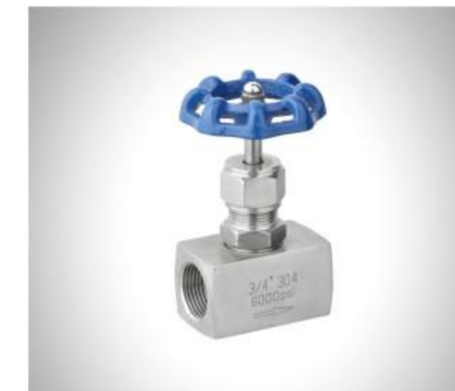
Needle Valve Size:1/4"-1" Material:SS304/SS316 Pressure:6000PSI Threaded:BSPT/BSPP/NPT