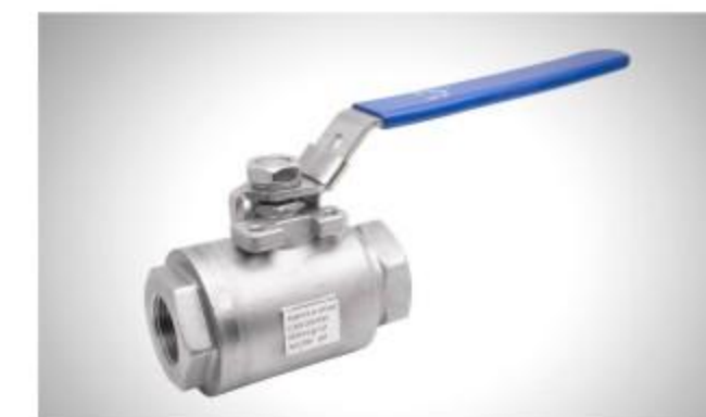
2PC Threaded Ball Valve Size:1/4"-2" Material:SS304/SS316/WCB Pressure:6000WOG Threaded Standard:BSPT/BSPP/NPT