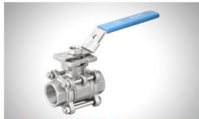
3PC Threaded Ball Valve With ISO5211 Mounting Pad Size:1/2"-4" Material:SS304/SS316/WCB Pressure:PN63 Dimension Standard:DIN3202-M3 Threaded Standard:BSP/DIN259/DIN2999