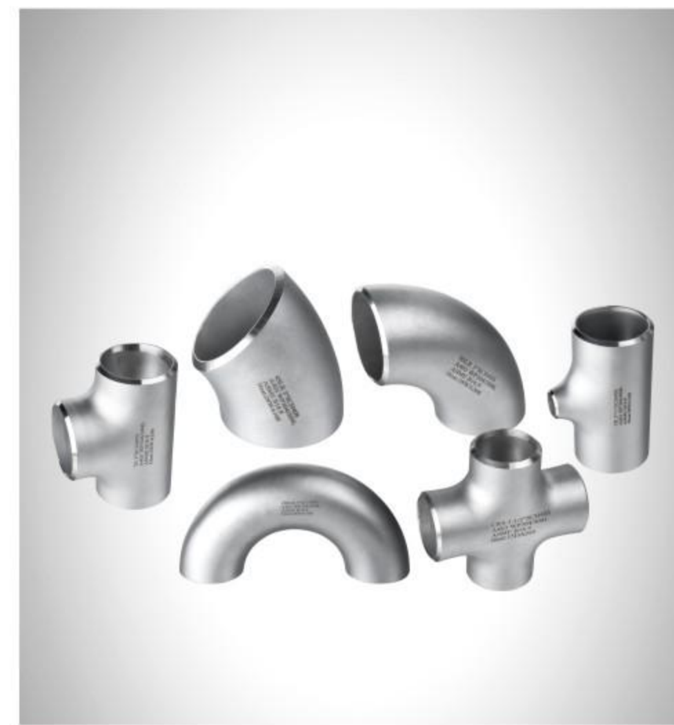
Pipe Fittings Size:1/4"-12" Material:SS304/SS316 Connection:Butt Welded