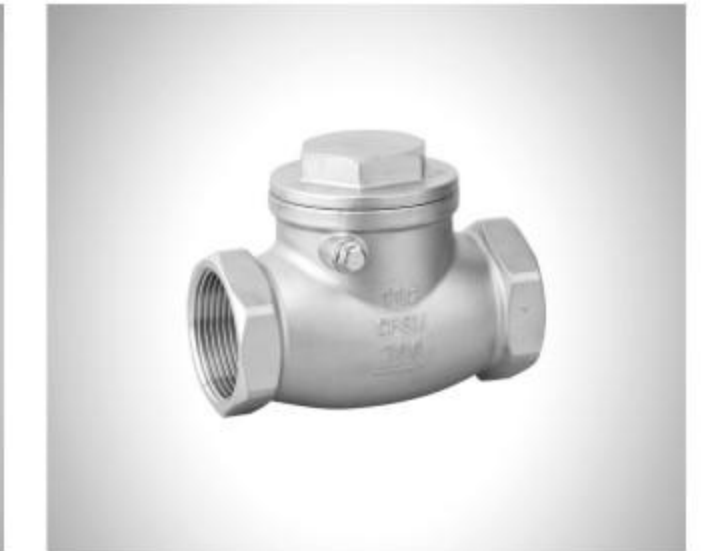
Swing Check Valve Size:1/2"-4" Material:SS304/SS316 Pressure:200PSI Threaded:BSPT/BSPP/NPT