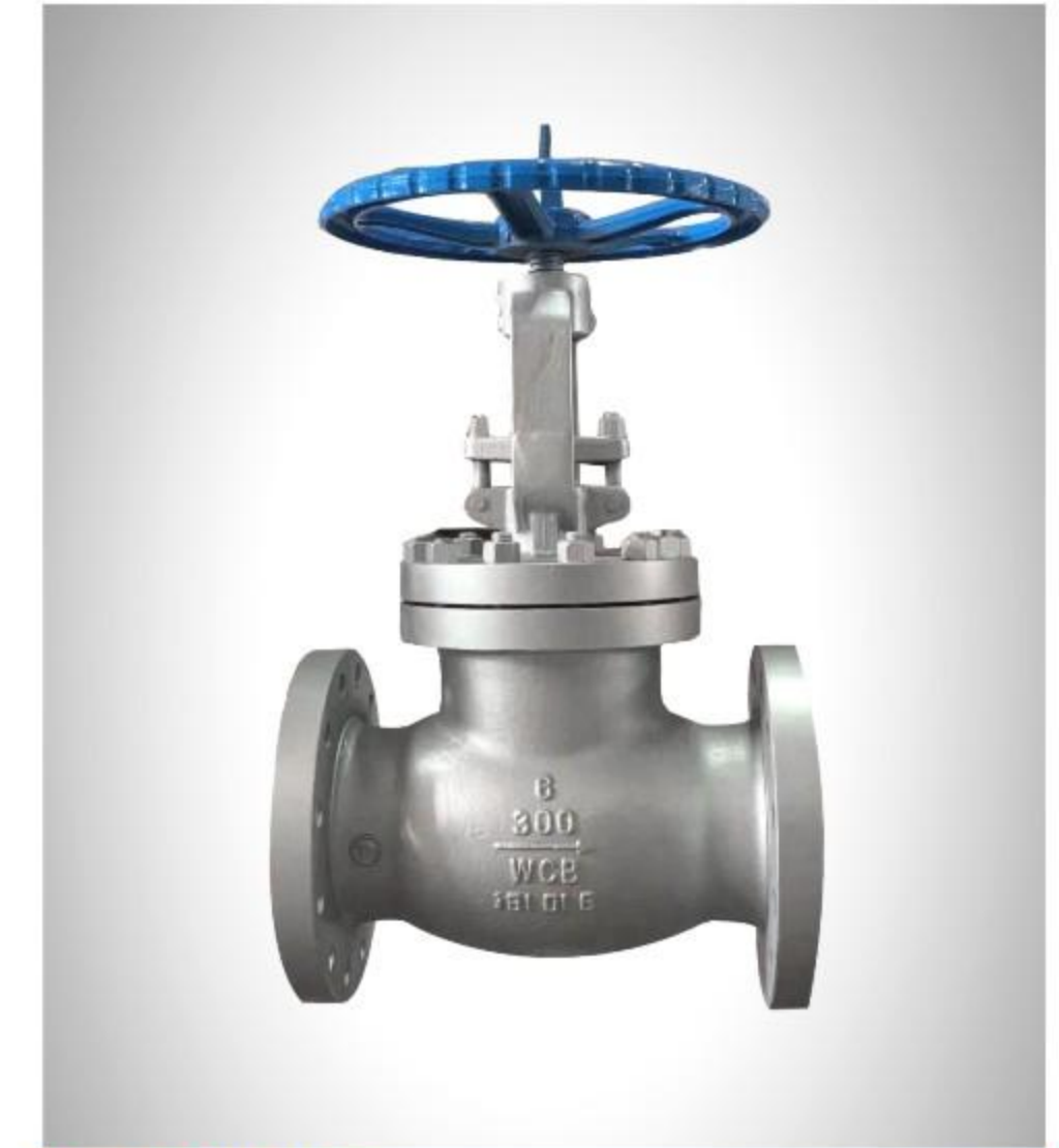
Flanged Globe Valve Size:2"-36" Material:SS304/SS316/WCB Pressure:150LB/300LB/600LB