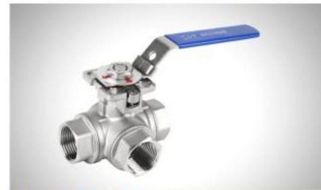
3 Way Ball Valve With ISO5211 Mounting Pad Size:1/2"-4" Material:SS304/SS316/WCB Pressure:PN63 Dimension standard:DIN3202-M3 Threaded Standard:BSP/DIN259/DIN2999