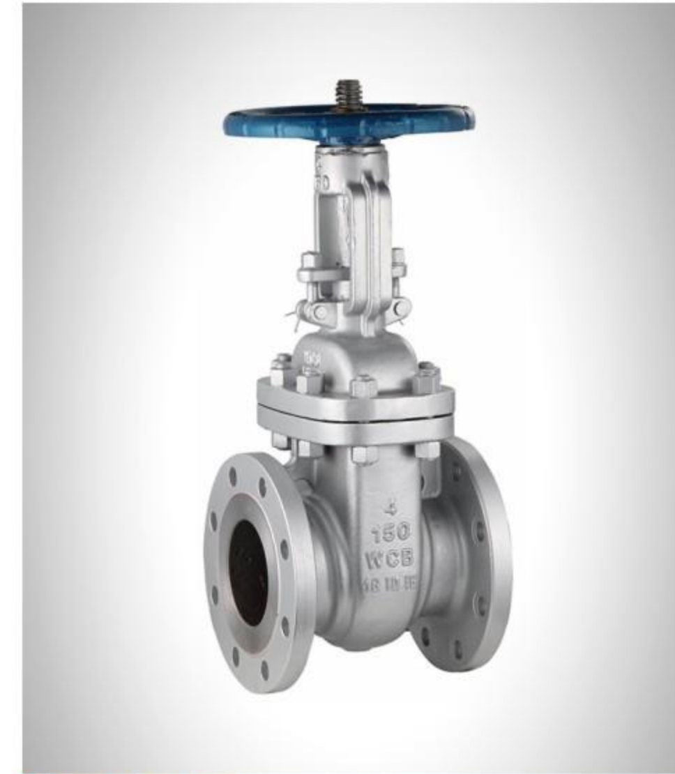
Flanged Gate Valve Size:2"-36" Material:SS304/SS316/WCB Pressure:150LB/300LB/600LB