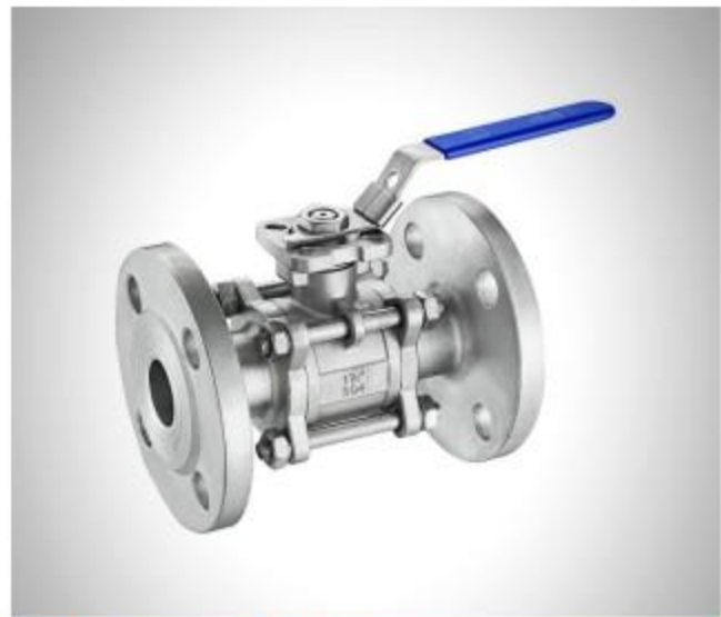
3PC Flanged Ball Valve With ISO5211 Mounting Pad Size:1/2"-4" Material:SS304/SS316 Pressure:PN40 Dimension Standard:DIN3202-F1 DIN Flanged End