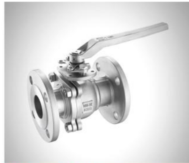
2PC Flanged Ball Valve Size:15A-300A Material:SCS13/SCS14 Pressure:10k/20k JIS Flanged End