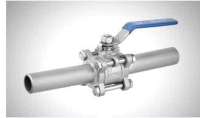
3PC Extended Welded Ball Valve Size:1/2"-4" Material:SS304/SS316/WCB Pressure:1000WOG Connection:Butt Weld