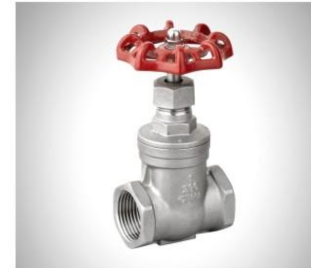
Gate Valve Size:1/2"-4" Material:SS304/SS316 Pressure:200 PSI Threaded:BSPT/BSPP/NPT