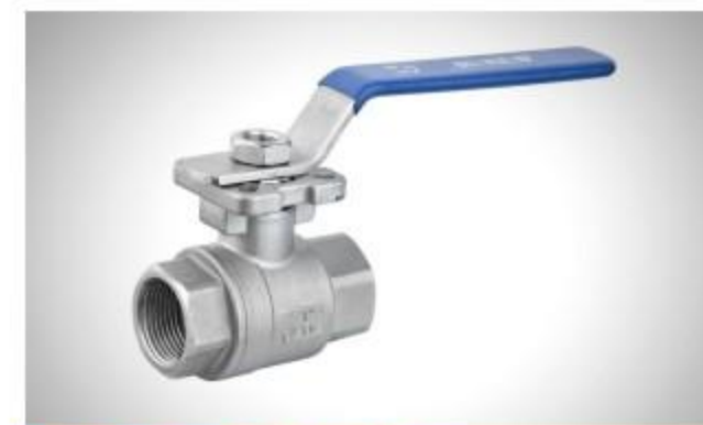
2PC Threaded Ball Valve With ISO5211 Mounting Pad Size:1/2"-4" Material:SS304/SS316/WCB Pressure:1000WOG Threaded Standard:BSPT/BSPP/NPT /DIN259/DIN2999