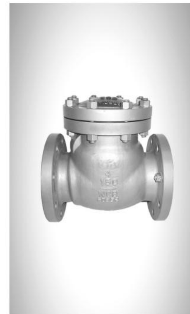
Flanged Swing Check Valve Size:2"-36" Material:SS304/SS316/WCB Pressure:150LB/300LB/600LB