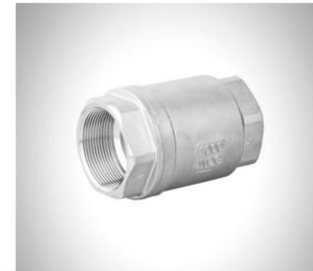
Vertical Lift Check Valve Size:1/2"-4" Material:SS304/SS316 Pressure:1000PSI Threaded:BSPT/BSPP/NPT