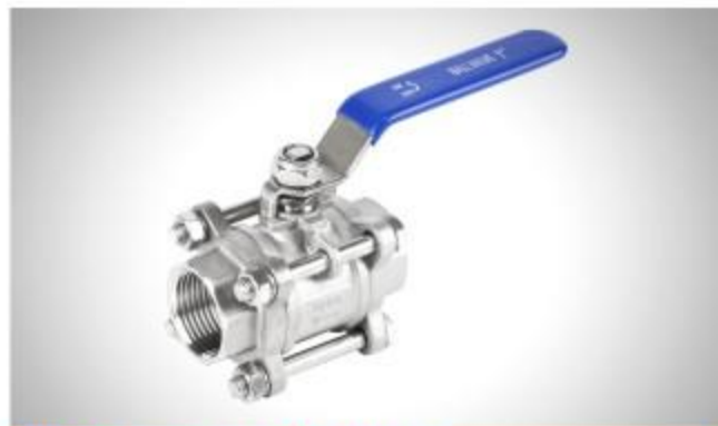
3PC Threaded Ball Valve Size:1/4"-4" Material:SS304/SS316/WCB Pressure:PN63 Dimension Standard:DIN3202-M3 Threaded Standard:BSP/DIN259/DIN2999