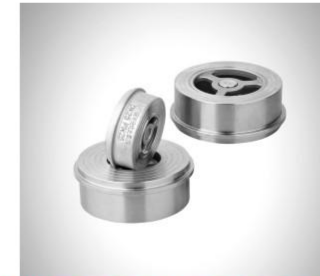
Wafer Type Check Valve(Disc Check Valve) Size:1/2"-12" Material:SS304/SS316 Pressure:PN40