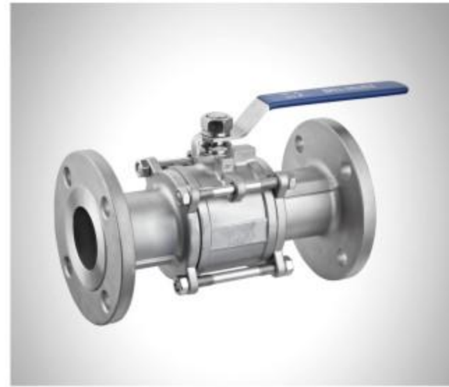
3PC Flanged Ball Valve Size:1/2"-4" Material:SS304/SS316 Pressure:PN40 Dimension Standard:DIN3202-F1 DIN Flanged End