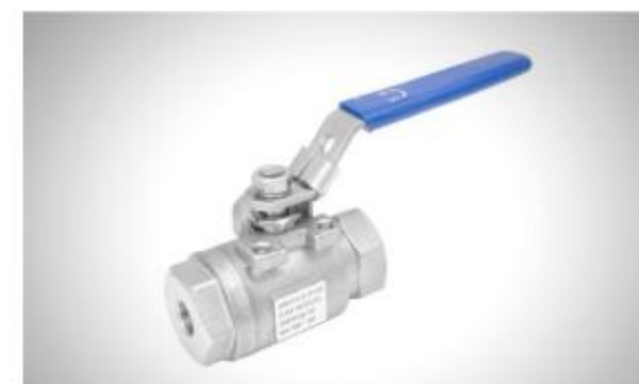
2PC Threaded Ball Valve Size:1/4"-2" Material:SS304/SS316/WCB Pressure:3600WOG Threaded Standard:BSPT/BSPP/NPT