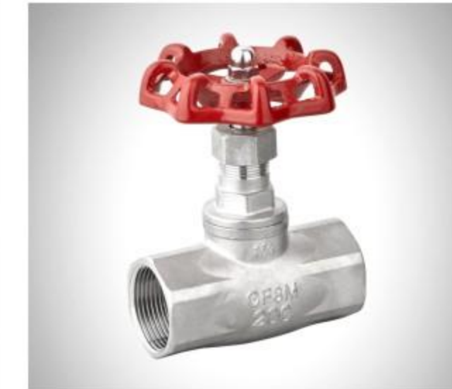
Globe Valve Size:1/2"-4" Material:SS304/SS316 Pressure:200 PSI Threaded:BSPT/BSPP/NPT