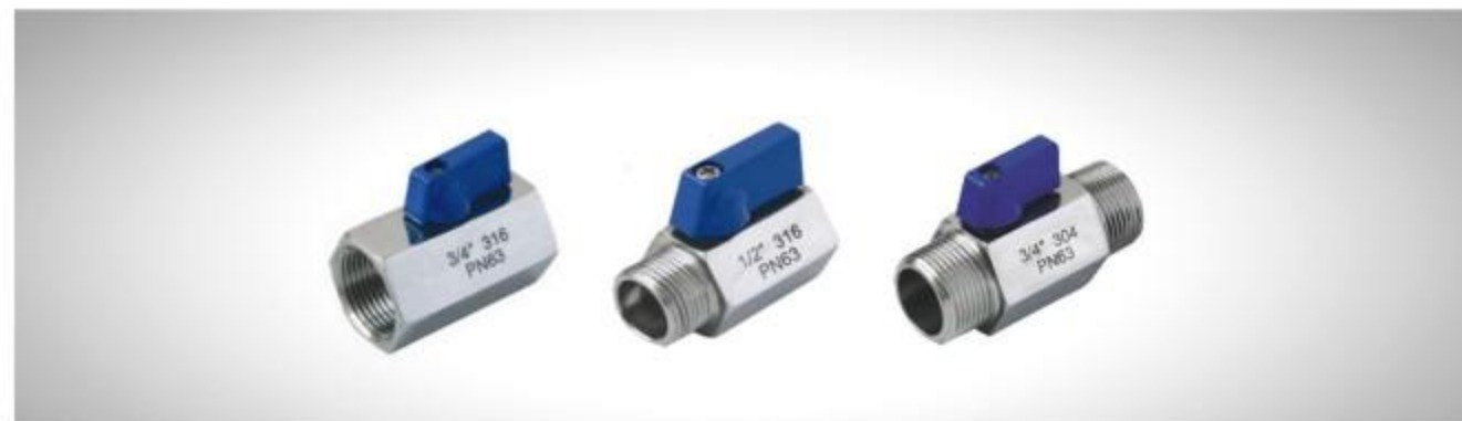
Mini Ball Valve (M/M,M/F,F/F) Size:1/4"-3/4" Material:SS304/SS316 Pressure:PN63 Threaded:BSP/DIN259/DIN2999