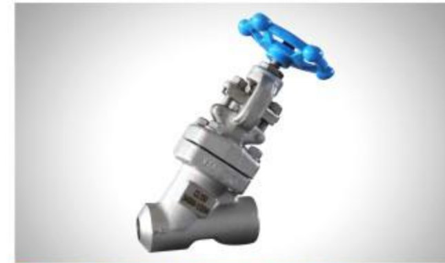
Forged Steel Y Type Globe Valve Size:1/2"-2" Material:F304/F316 Pressure:800LB Connection:Threaded/Welded