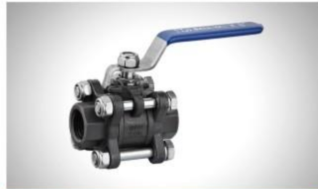
3PC Threaded Ball Valve Size:1/4"-4" Material:WCB Pressure:1000WOG Threaded Standard:BSPT/BSPP/NPT DIN259/DIN2999