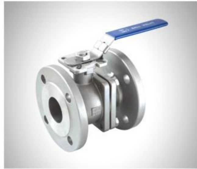
2PC Flanged Ball Valve With ISO5211 Mounting Pad Size:1/2"-8" Material:SS304/SS316 Pressure:PN40 Dimension Standard:DIN3202-F4 DIN Flanged End