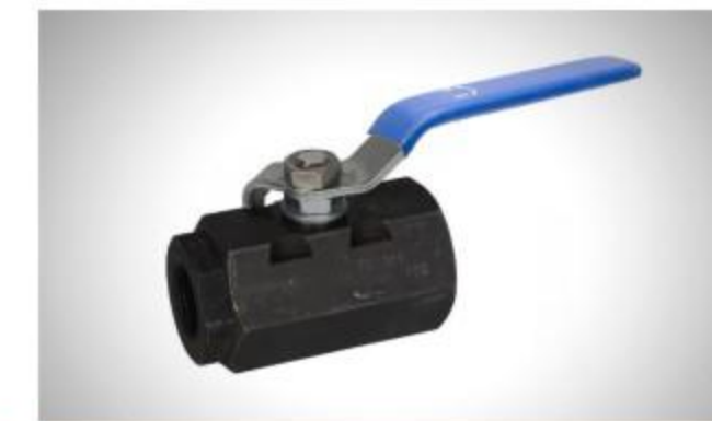
2PC Hex Bar Ball Valve Size:1/4"-2" Material:A105 Pressure:2000WOG Threaded Standard:BSPT/BSPP/NPT