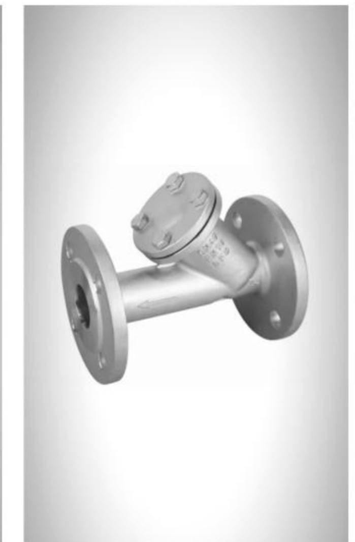
Flanged Y Type Strainer Size:1/2"-12" Material:SS304/SS316/WCB Pressure:PN16/PN40