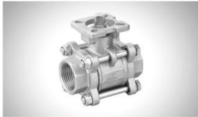
3PC Threaded Ball Valve With ISO5211 Mounting Pad Size:1/2"-4" Material:SS304/SS316/WCB Pressure:1000WOG Threaded Standard:BSPT/BSPP/NPT /DIN259/DIN2999