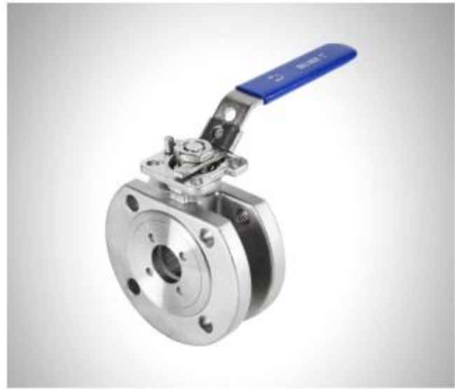
Wafer Type Flanged Ball Valve With ISO5211 Mounting Pad Size:1/2"-4" Material:SS304/SS316 Pressure:PN40 DIN Flanged End