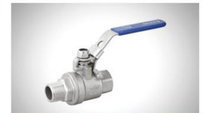
2PC M / F Threaded Ball Valve Size:1/4"-2" Material:SS304/SS316/WCB Pressure:1000WOG Threaded Standard:BSPT/BSPP/NPT DIN259/DIN2999