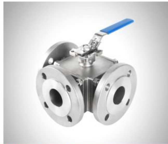
3 Way Flanged Ball Valve With ISO5211 Mounting Pad Size:1/2"-4" Material:SS304/SS316 Pressure:PN16