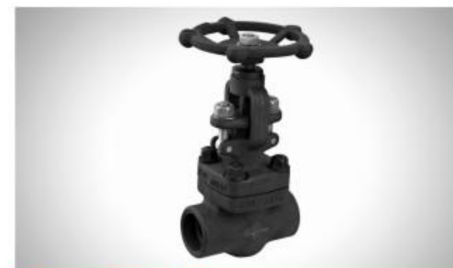
Forged Globe Valve Size:1/2"-2" Material:A105 Pressure:800LB Connection:Threaded/Welded