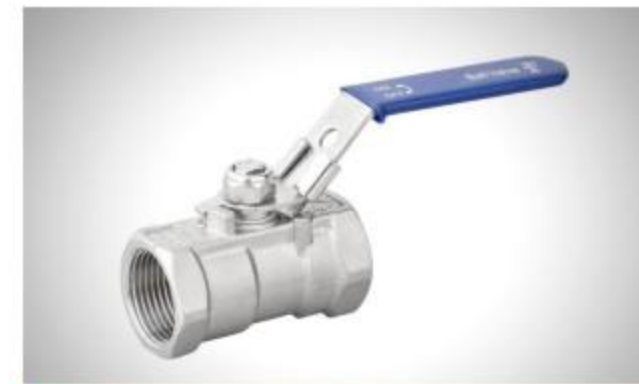
1PC Threaded Ball valve Size:1/4"-4" Material:SS304/SS316/WCB Pressure:1000WOG Threaded Standard:BSPT/BSPP/NPT DIN259/DIN2999