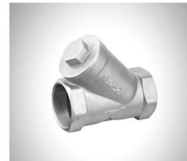
Y Type Strainer Size:1/2"-4" Material:SS304/SS316/WCB Pressure:800WOG Threaded: BSPT/BSPP/NPT