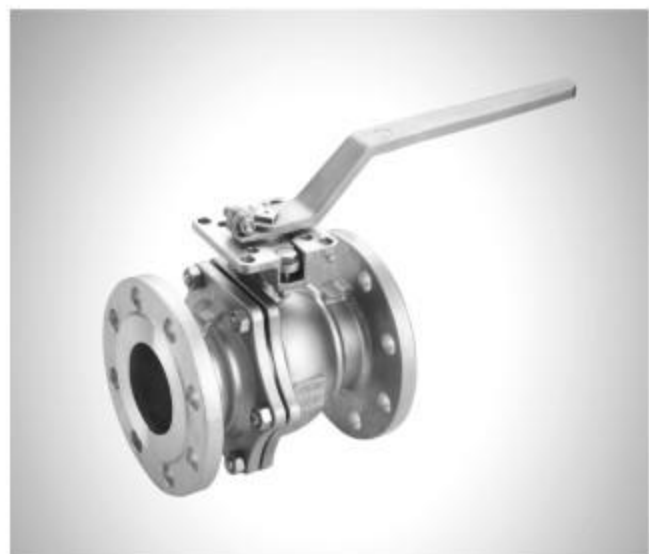
2PC Flanged Ball Valve With ISO5211 Mounting Pad Size:15A-300A Material:SCS13/SCS14 Pressure:10k/20k JIS Flanged End