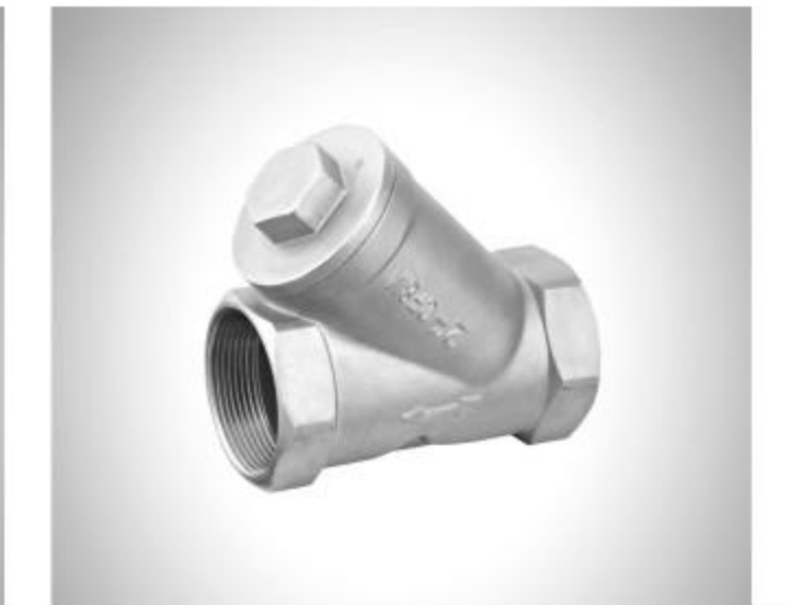
Y Type Check Valve Size:1/2"-4" Material:SS304/SS316/WCB Pressure:800WOG Threaded: BSPT/BSPP/NPT