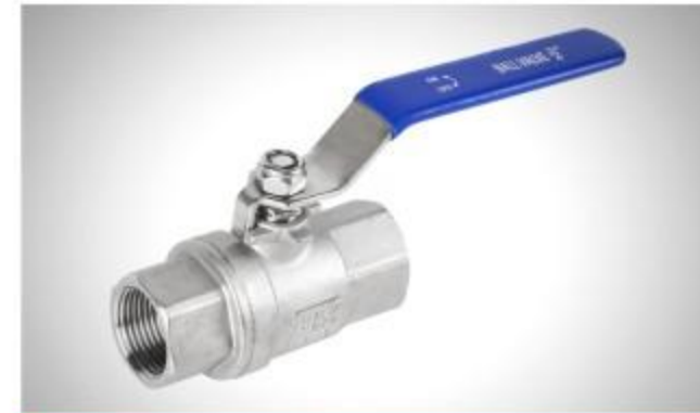
2PC Threaded Ball Valve Size:1/4"-4" Material:SS304/SS316/WCB Pressure:PN63 Dimension Standard:DIN3202-M3 Threaded Standard:BSP/DIN259/DIN2999