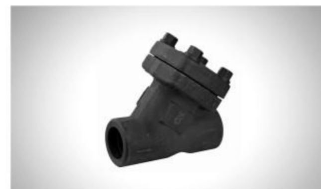
Forged Steel Y Type Strainer Size:1/2"-2" Material:A105 Pressure:800LB Connection:Threaded/Welded