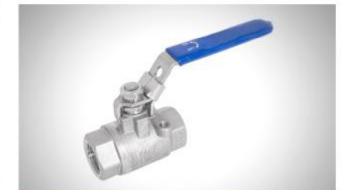
2PC Threaded Ball Valve Size:1/4"-2" Material:SS304/SS316/WCB Pressure:2000WOG Threaded Standard:BSPT/BSPP/NPT