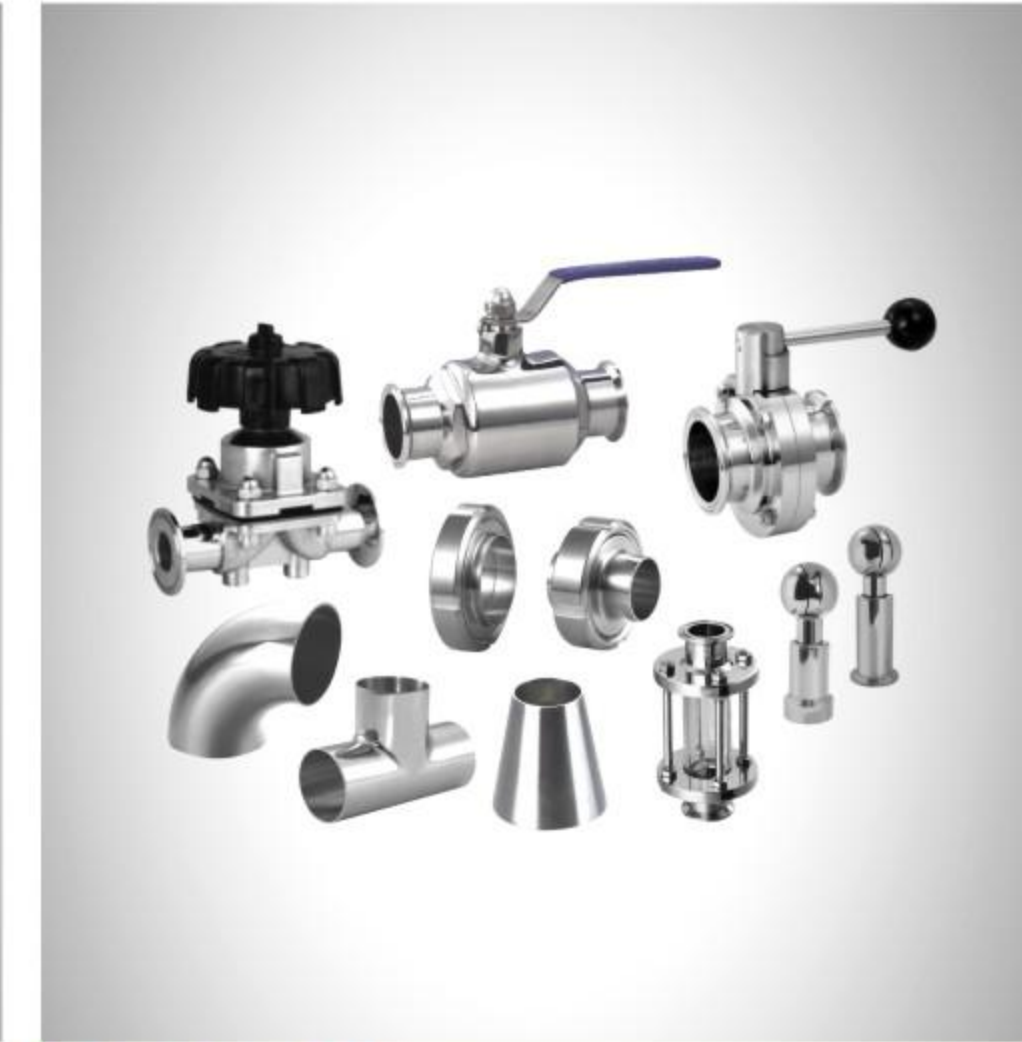
Sanitary Valves And Fittings Size:1/4"-4" Material:SS304L/SS316L Pressure:1.6Mpa Connection:Threaded/Flanged/Welded/Clamp