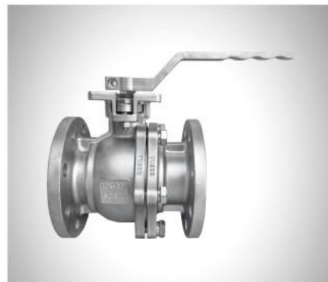
2PC Flanged Ball Valve With ISO5211 Mounting Pad Size:1/2"-12" Material:CF8/CF8M/WCB Pressure:150LB/300LB ANSI Flanged End