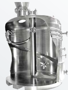
Mixing shaft, mixing arms and spiral tool are heatable on demand.