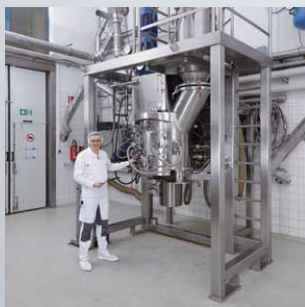
VMT 200 made from Alloy 59

The reactor is vacuum and pressure tight and heatable by steam, thermal oil or water. On request also insulated.