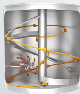
Upward moving in the periphery and downward moving in the center