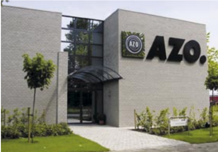
The AZO Antwerp customer centre, with ultra-modern testing area and seminar space.