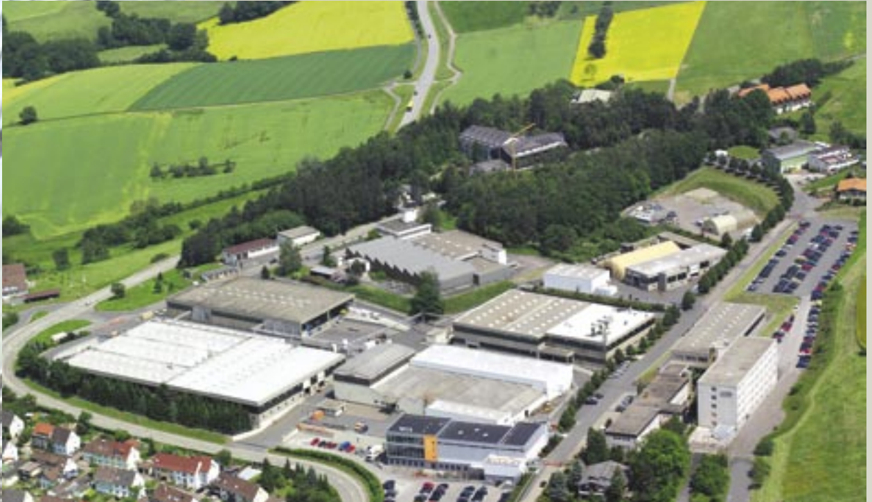
AZO-Osterburken with the new technology centre in the foreground.