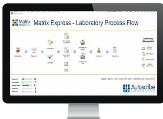
Matrix Express - an 'off-the-shelf' LIMS

Designed to be used 'off-the-shelf', Matrix Express provides all the basic functionality required in a LIMS solution.