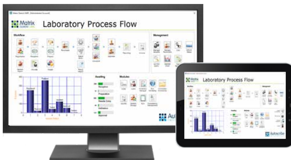
Matrix Gemini LIMS - dual desktop and web browser interfaces

these demanding needs and yet be easily configurable by Autoscribe, or by the user, to keep in step with evolving laboratory needs and working practices.