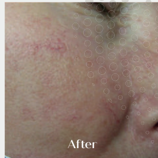
Vascular | Courtesy of Laser Skin Solutions