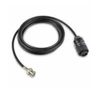
Video Input Cable