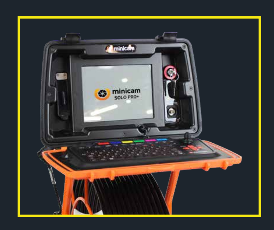
ENGINEERED FOR EXPLOSION-RISK ENVIRONMENTS