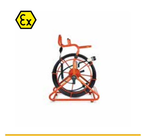
40 metre Rod