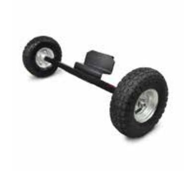
All Terrain Wheels