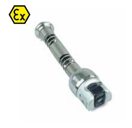
CAM050 - Pan-Rotate Laser