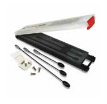
Lateral Pin Kit