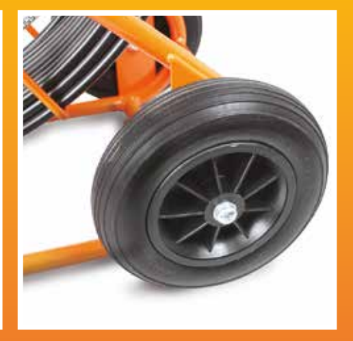
Integrated Meterage Measurement