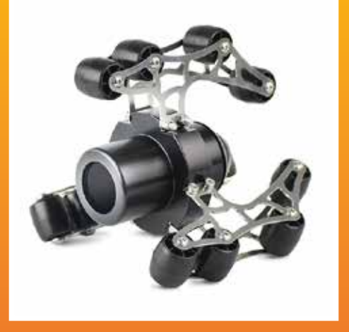
ASS-001-955 & CAM026