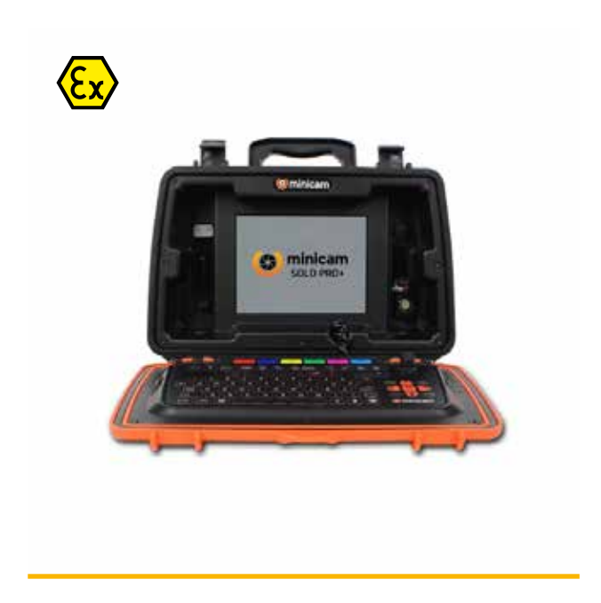
CCU210 Control Unit