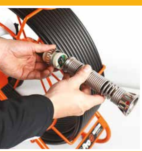
Heavy Duty Camera Connector