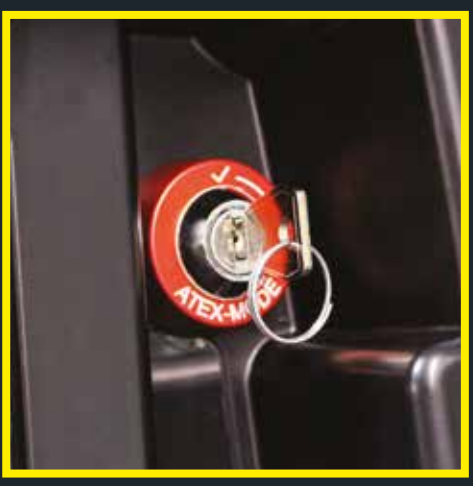
ATEX CCU210 override key