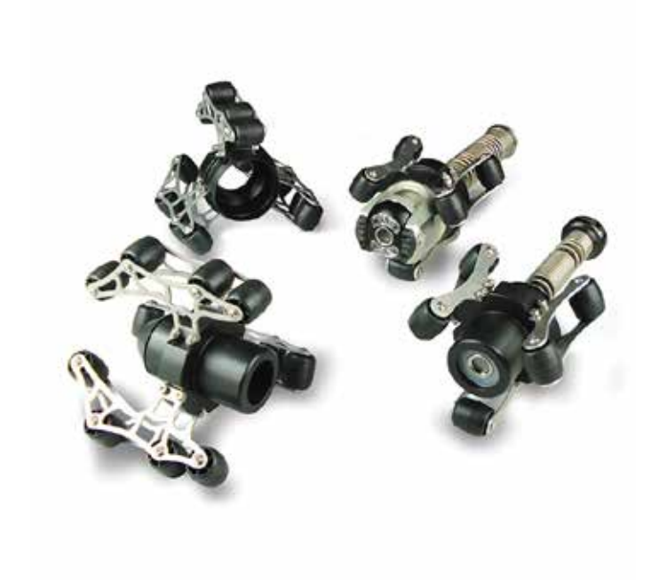
Aailable in two sizes to fit the CAM025 Self Levelling Axial Camera and the CAM026 Pan & Rotate Camera.