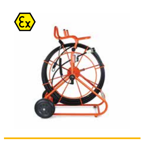
60 metre Rod