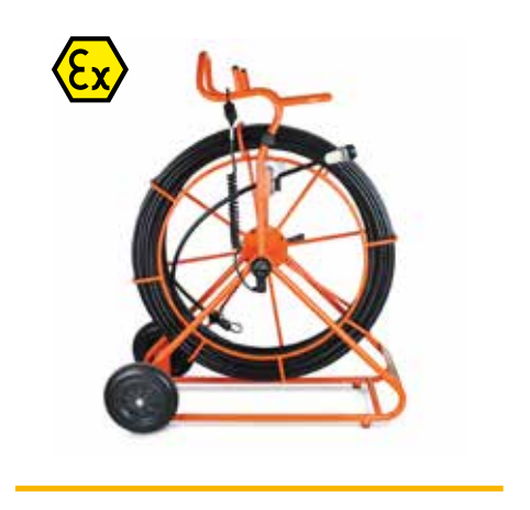
100 metre Rod