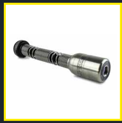
Axial Camera CAM025EX