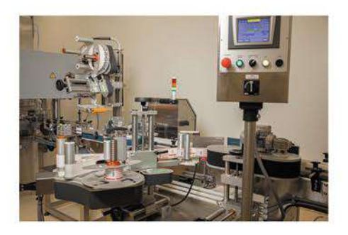
Labelling / coding