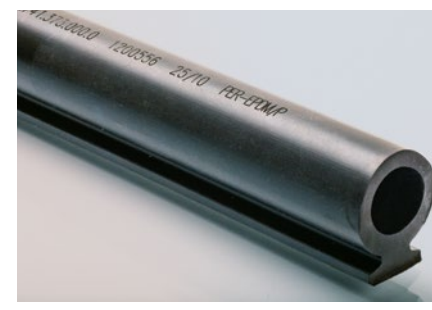
Marking of rubber profiles