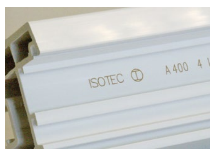
Marking of plastics