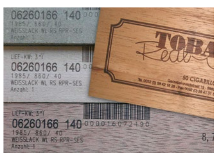
Marking of wooden profiles