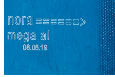
Marking of composite materials