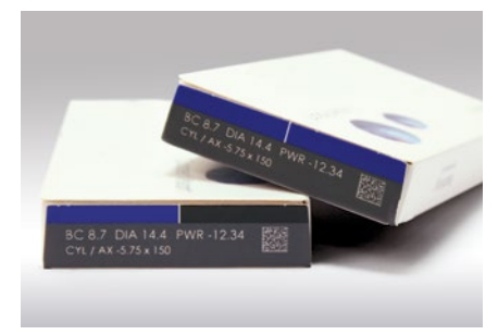
Coding and marking of packaging through color removal