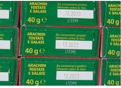
Writing on cardboard boxes