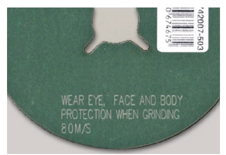
Writing on sanding discs