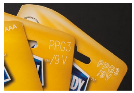
Writing on card