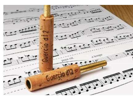
Writing on cork