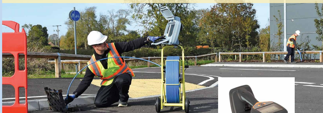
P341 Plumbers Reel