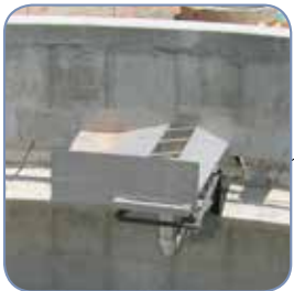
Scum Box (OPTION)