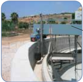
Scum Removal System and Motorised Brush (OPTION)