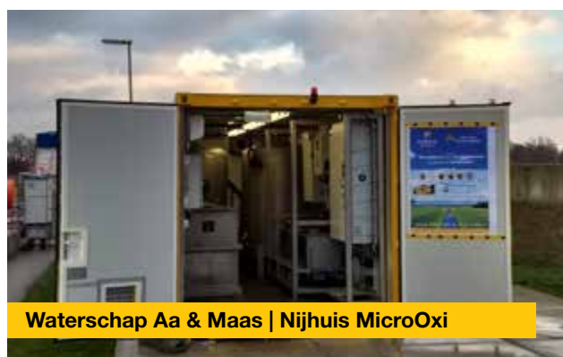
Waterschap Aa & Maas | Nijhuis MicroOxi

For the treatment of micropollutants at sewage treatment plants, Nijhuis Industries has developed the MicroOxi solution. Depending on the local situation, a smart combination of oxidation technologies will be chosen to effectively remove a wide variety of medicines of more than 80%. With intelligent ozone dosage regulation based on organic load of the water. It is a customized, efficient and extensible solution based on the pollution level in the wastewater towards a sustainable and resilient future.