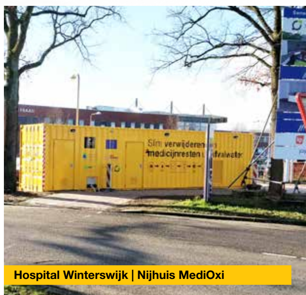
Hospital Winterswijk | Nijhuis MediOxi

The MediOxi solution of Nijhuis Industries is a treatment-at-the-source focused solution for medicine and micropollutant removal. It uses different filtration and separation techniques and a combination of oxidative techniques to convert recalcitrant compounds into biological degradable molecules. Using sufficient dosing and the correct combination of techniques, it is possible to reach significant reduction of medical residues or convert them so they can be further degraded inside a conventional wastewater treatment plant. The solution can be completely containerized and placed at sources like hospitals, elderly homes, or pharmaceutical companies. Nijhuis Industries has already proven to be able to remove a wide variety of medicines and x-ray contrast media effectively (>80%) from hospital wastewater.