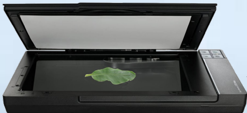
Entry Level System - Flatbed Scanner

Hardware: Users of Standard WinDIAS Systems supplied after March 2019 can upgrade to the Rapid System simply by ordering a Conveyor Belt Unit (subject to voltage type). Users of older WinDIAS systems wishing to update the lighting or add a Conveyor Belt Unit should contact Delta-T for guidance software.