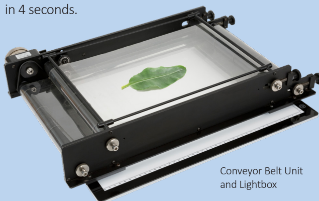
Conveyor Belt Unit and Lightbox

Long leaves: With the addition of the Conveyor Belt Unit, WinDIAS can measure leaves which are too long to fit in the field of view of the video camera. WinDIAS software repeatedly samples the leaf image as it moves past the camera at constant speed. Stored data sets include total area and the percentages of healthy and diseased leaf area. Typically, a leaf 30 cm long by 2 cm wide can be measured in 4 seconds.