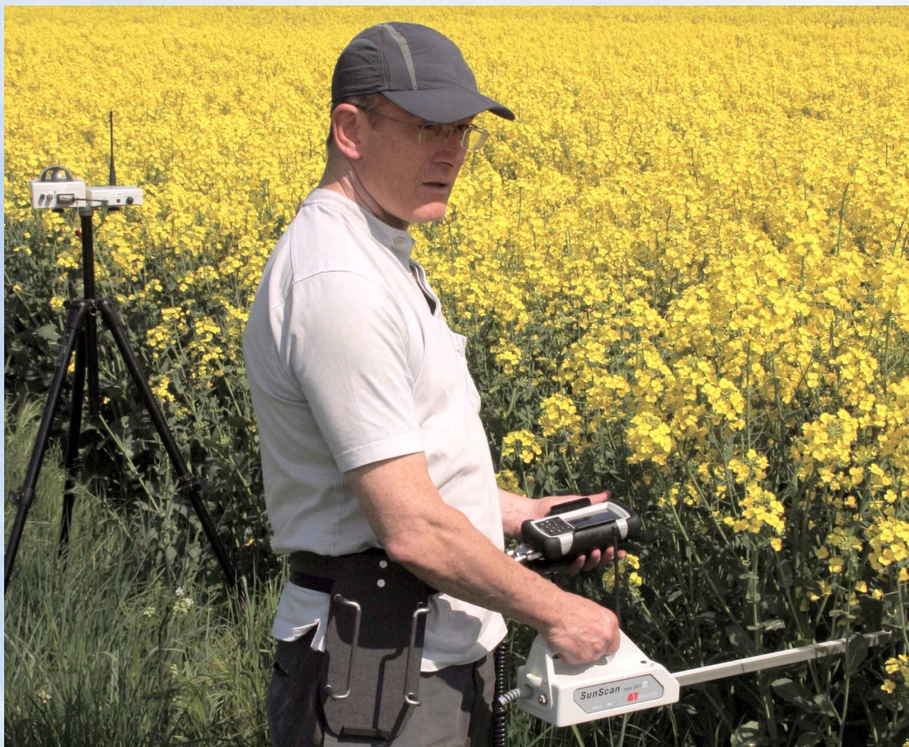
SunScan Probe (radio version) and PDA, with radio-linked BF5 Sunshine Sensor mounted on tripod