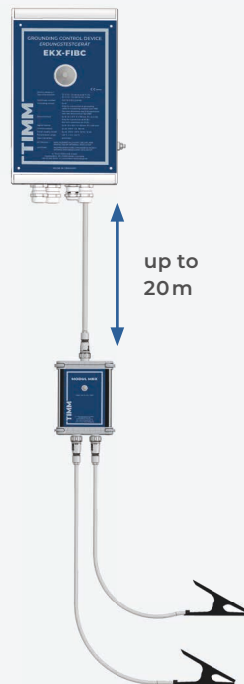
Monitoring of 1 big bag with remote LED indicator