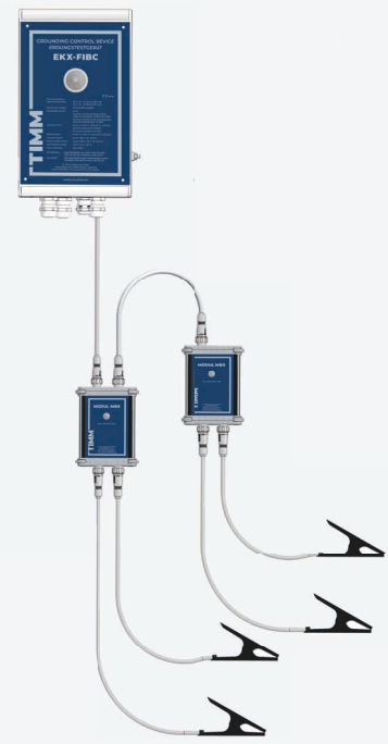
Simultaneous monitoring of 2 big bags

For further information and additional accessories, visit us at www.timm-technology.de/en/products/ekx-fibc or contact us.