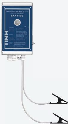
Monitoring of 1 big bag