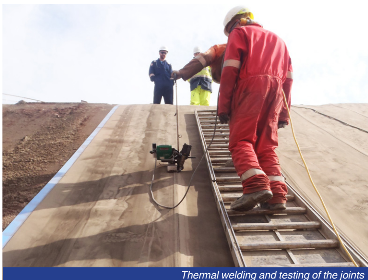
Thermal welding and testing of the joints