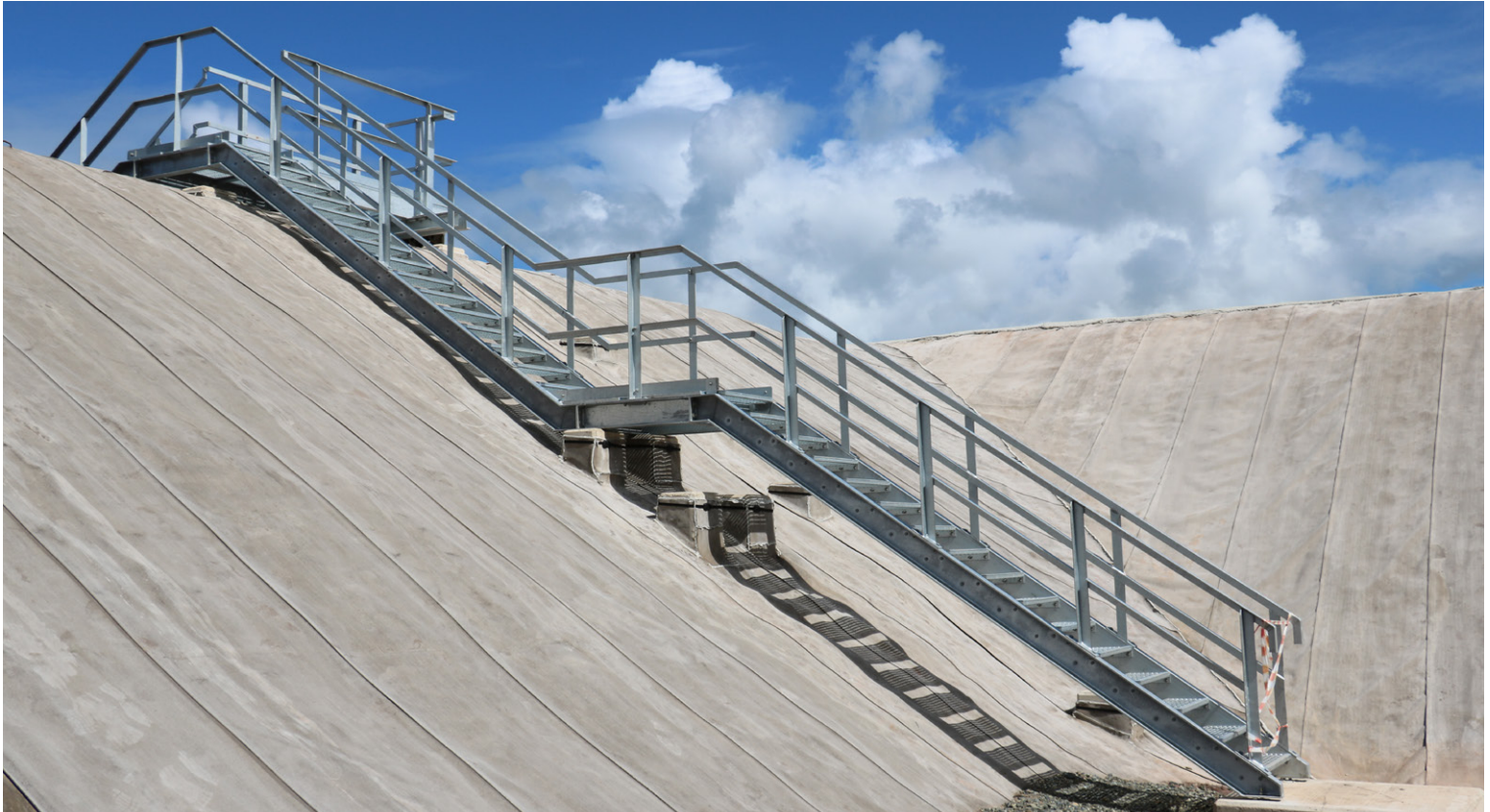
Step access detail