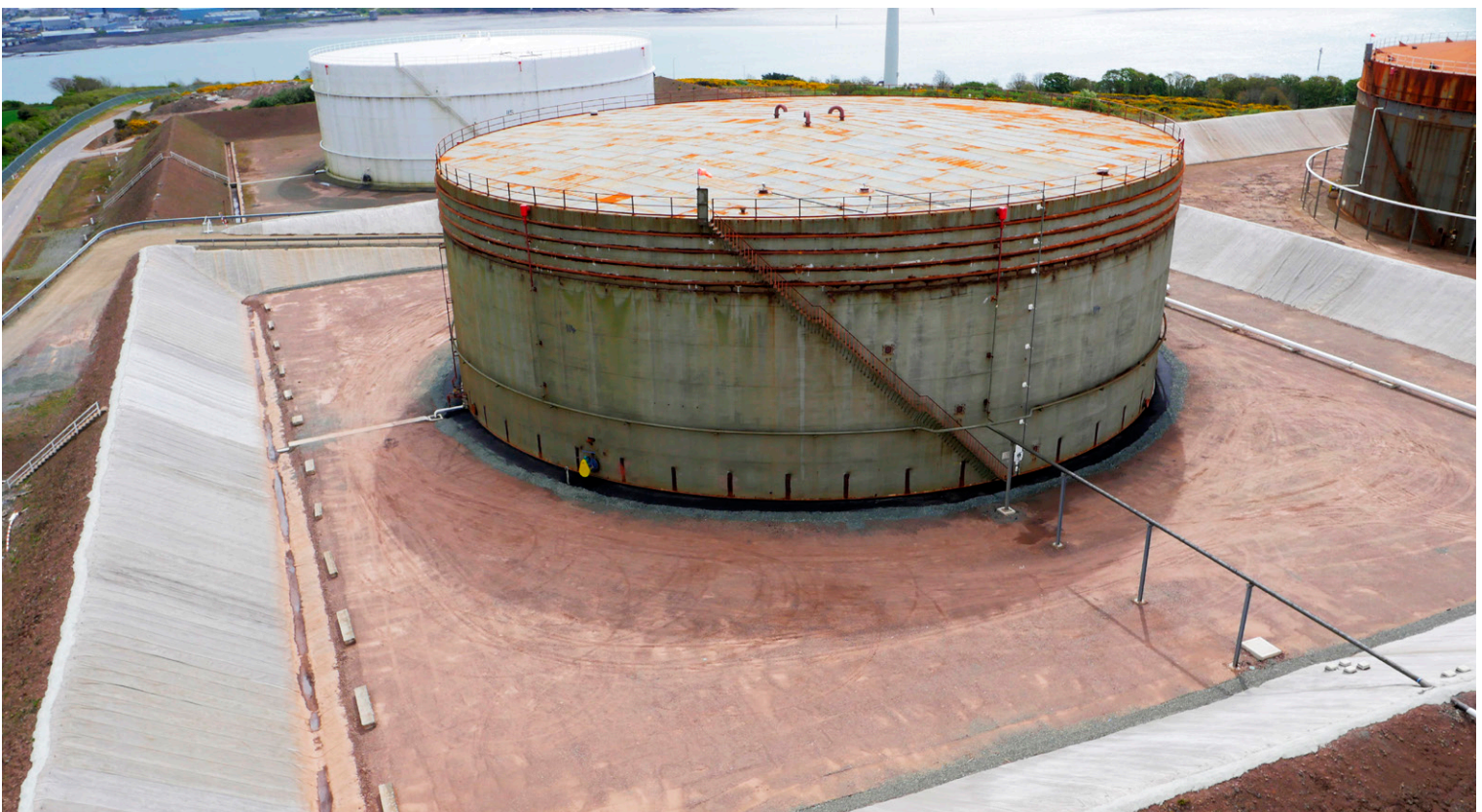
Image from drone footage of Tank 114 during installation and prior to painting of tank