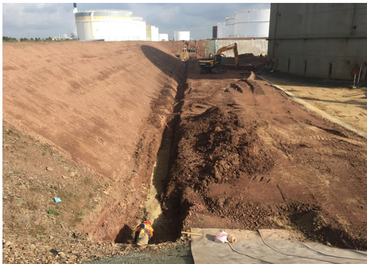
Preparation of the substrate

Following the welding and testing of the joints, CC Hydro™ was hydrated via the local on site water mains. CC Hydro™ cannot be over hydrated so there was no requirement to measure exactly the water:CC ratio.