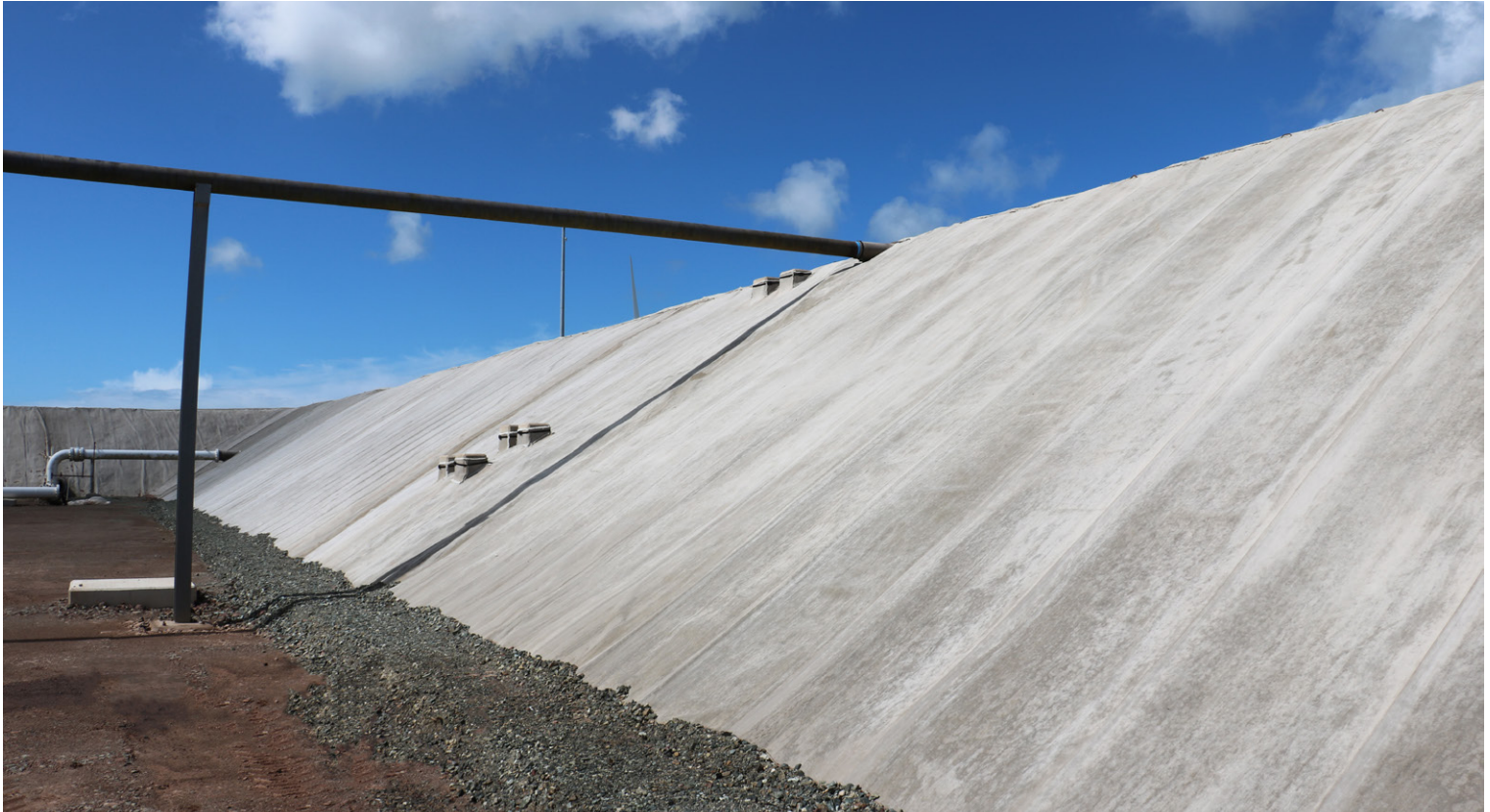
Pipe penetration detail in western elevation of Tank 114