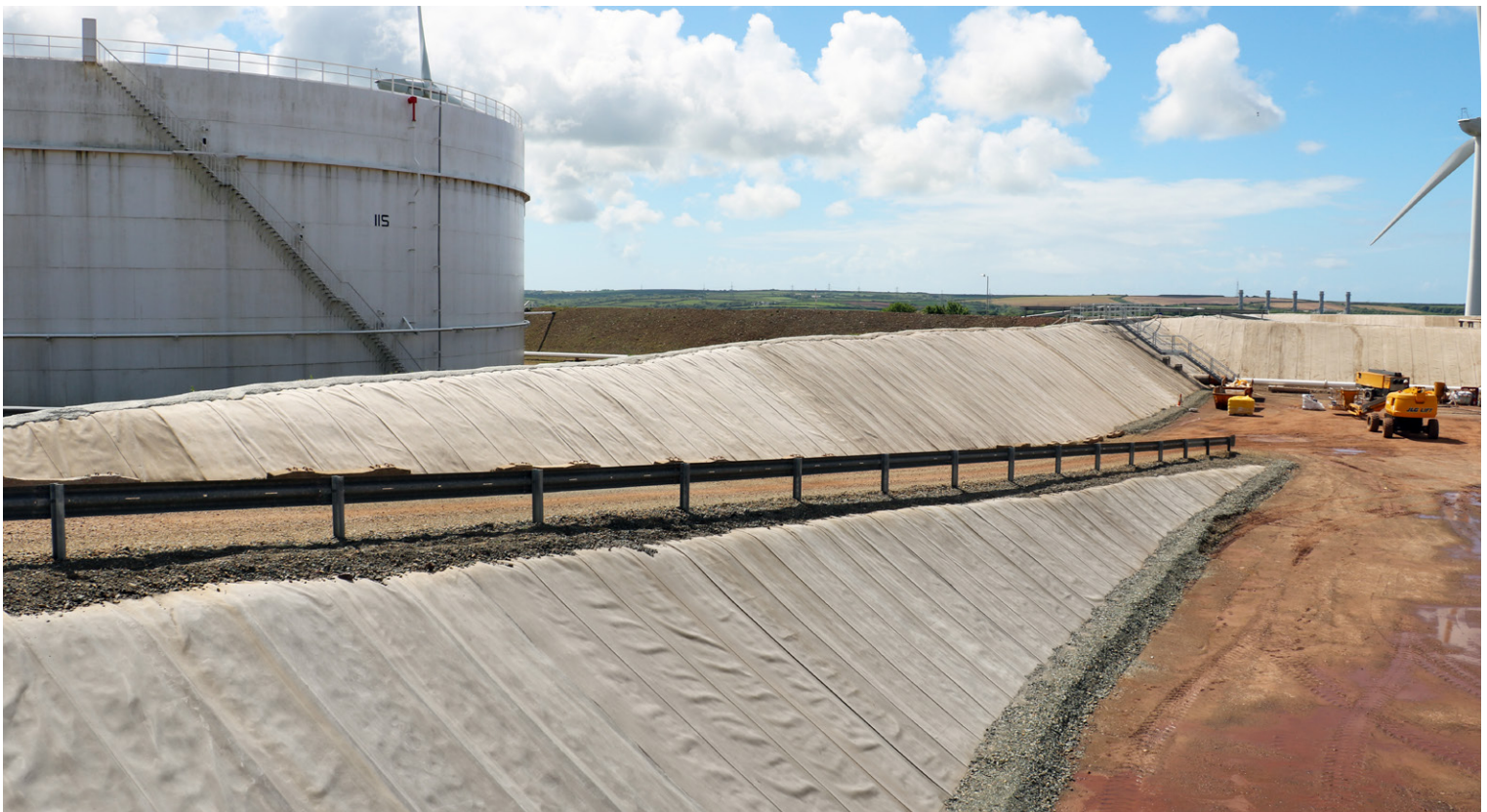
Access ramp detail