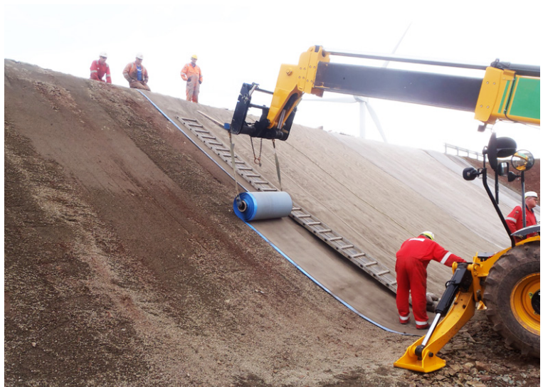
Deployment of the CCH