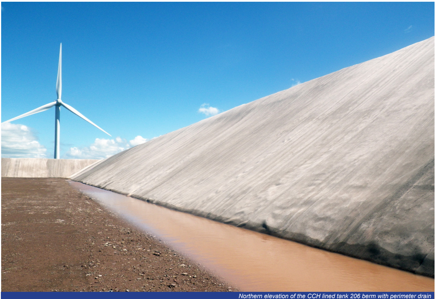
Northern elevation of the CCH lined tank 206 berm with perimeter drain

Following the success of the lining of tank 114, the system is being proposed for future containment schemes across the site and was awarded an ICE (Institute of Civil Engineers) Innovation Award in July 2017.