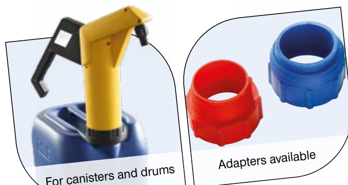
For canisters and drums