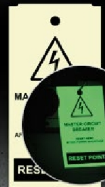
NEW! ReGLO Glow-in-the-dark

PLUS! The SMS TAG-ID2 is ideal for all these industrial applications: