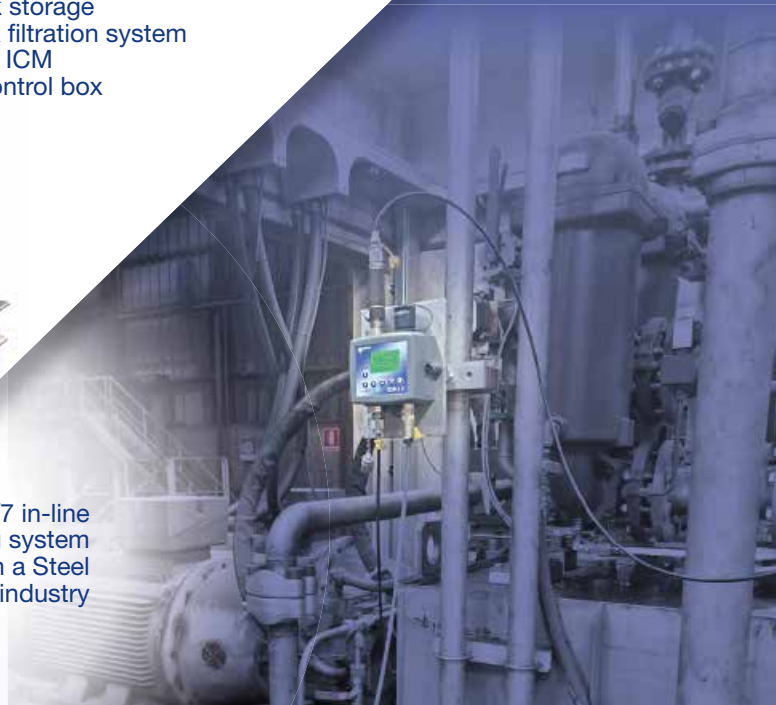
24/7 in-line monitoring system by ICM in a Steel plant industry