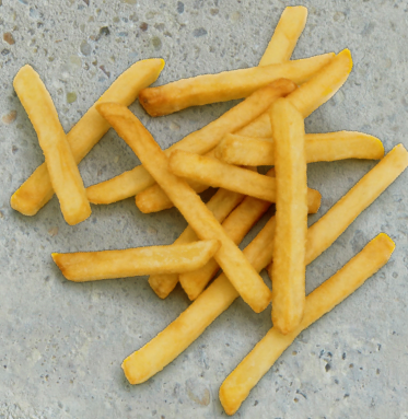
Crispy Salted 7/7 mm