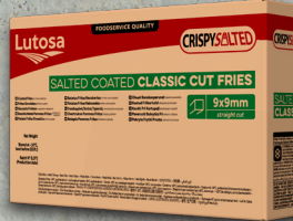
Crispy Salted 9/9 mm