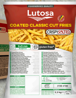
Crispy Salted 9/9 mm