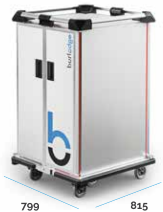
1363 short version 1603 tall version

Brilliantly consistent performance ensures reliable meal delivery and patient satisfaction, time and time again.