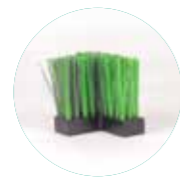
Green Brush element