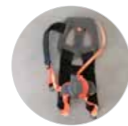
Weight support Harness