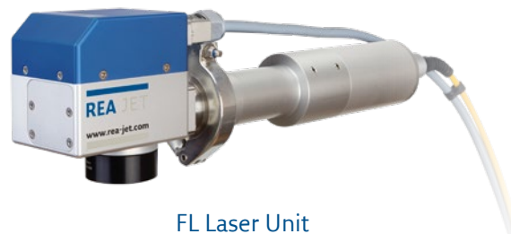
FL Laser Unit