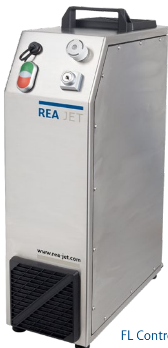
FL Controller Unit