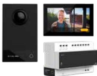
Video kit, 2-wire, with access control module, external and internal video unit ref. 510-01501 650 euro

You can connect up to 5 internal video units to the same module and even use them as an intercom to connect different parts of your home. Or what about a second external video unit for your back door or home office? The possibilities are endless .