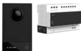
Videokit, 2-wire, with access control module and internal video unit ref. 510-01001 420 euro